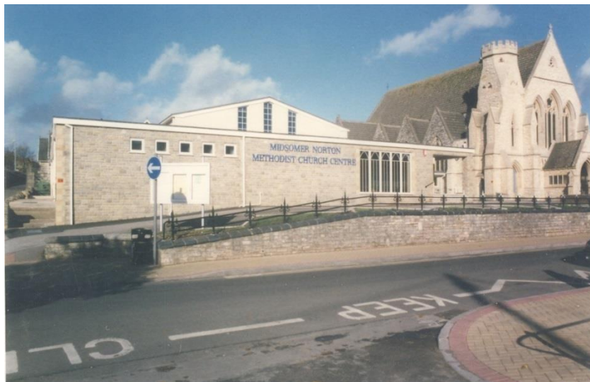
The new Midsomer Norton Methodist Church Centre 1996

After completion of the refurbishment of the church, building work was started in 1995 on the second phase. The design, undertaken by David Beresford-Smith involved a complete remodelling and modernisation of the original hall together with the construction of a link building to connect with the church. The outside of the building being faced with reconstructed stone which would eventually weather to match the church. The old stage in the hall was then removed giving a larger floor area and four new toilets were installed together with a fully equipped kitchen.