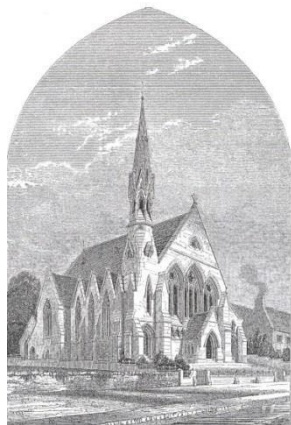
NEW WESLEYAN CHAPEL MIDSOMER NORTON

By 1845 it was decided that a new chapel should be built and £1,480 was offered for this purpose. The new chapel was to seat between 800 and 900 people and was to be 132 feet long and 43 feet wide. The sum of £50 was then offered for the best design. Several designs were submitted but the design submitted by Foster & Wood of Bristol was finally accepted. However, the original spire was never built because a man who had offered £1,000 threatened to withdraw his offer if the spire was built.