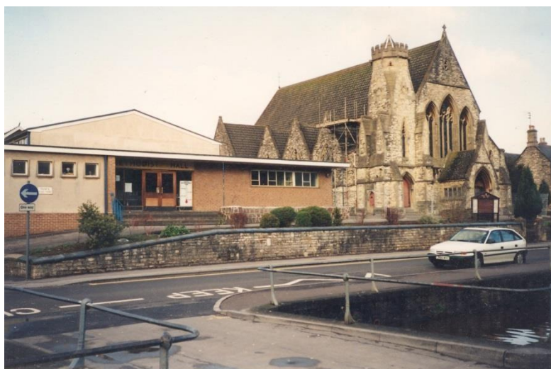
The Church Hall 1957 – 1996