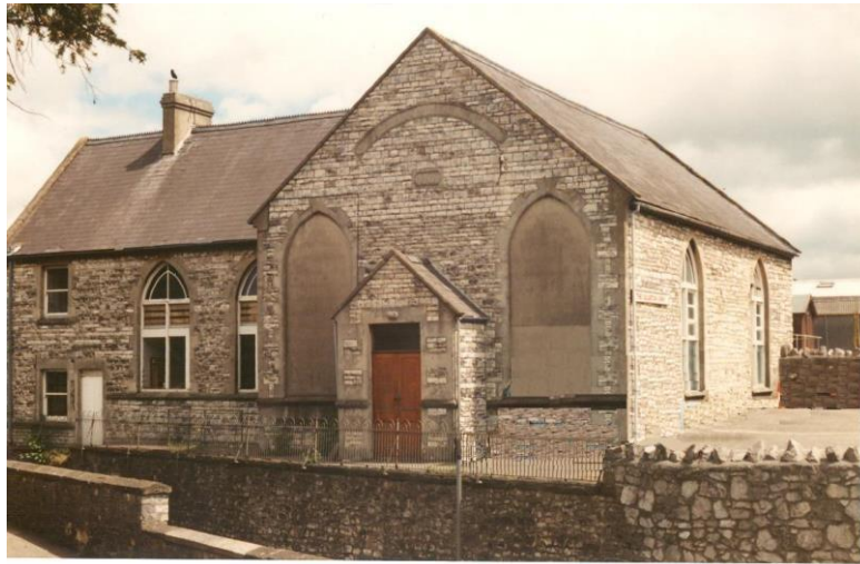
Stones Cross Chapel 1907 – 1963

In the early years of the 20th Century, the Primitive Methodist Society at Welton decided to build a Mission Chapel at Stones Cross. However, during the construction of this new building, many of the new members decided to leave Welton and form a new Society at Stones Cross; As a result, a new trust was formed.