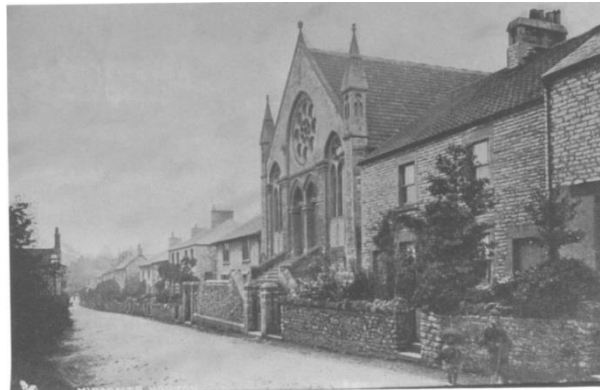
Redfield Road Church