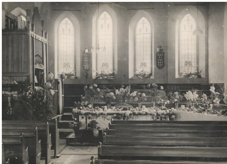
Harvest Festival at Stone's Cross

This new Society continued to flourish for many years with a strong Sunday school, a Ladies Guild, a Choir and an active Christian Endeavour. However, over the ensuing years, because of a decline in membership it was agreed, in 1963, that the chapel should be closed and the members transferred to the High Street Church.