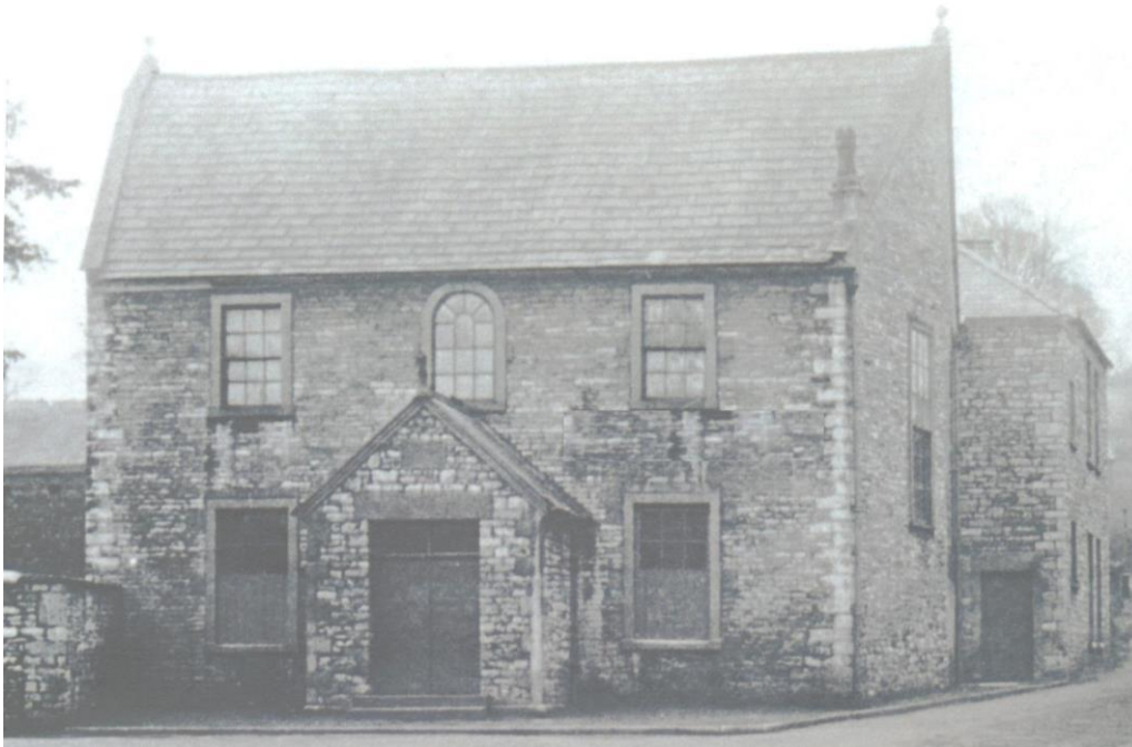
First Methodist Chapel – 1775