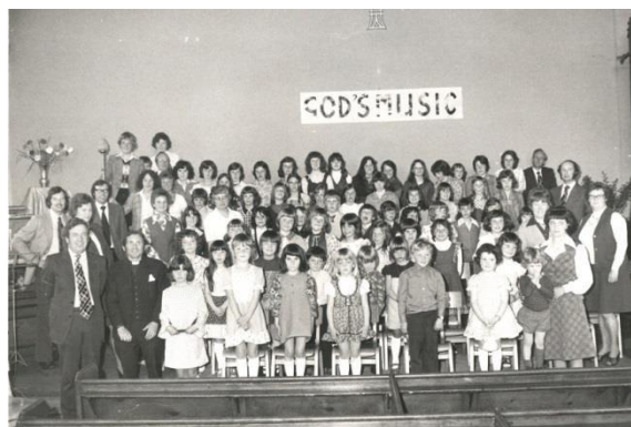
Sunday School Anniversary 1976